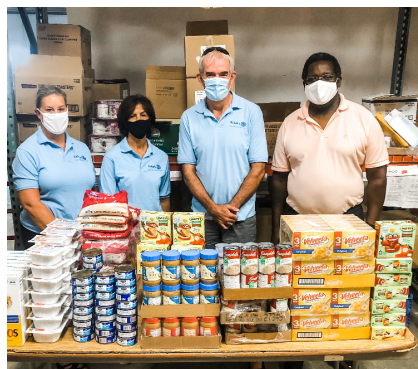
Packing Backpacks for nutritionally at risk children in New Paltz

The Four-Way Test is a code of conduct for Rotarians to apply to any endeavor in their professional or private lives. 1 - Is it the truth? 2 - Is it fair to all concerned? 3 - Will it build good will and better friendships? 4 - Will it be beneficial to all concerned?